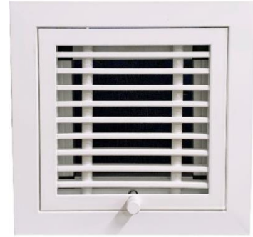
Hinged Type Bar Grille