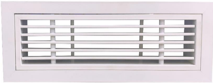
Removable Core Bar Grille